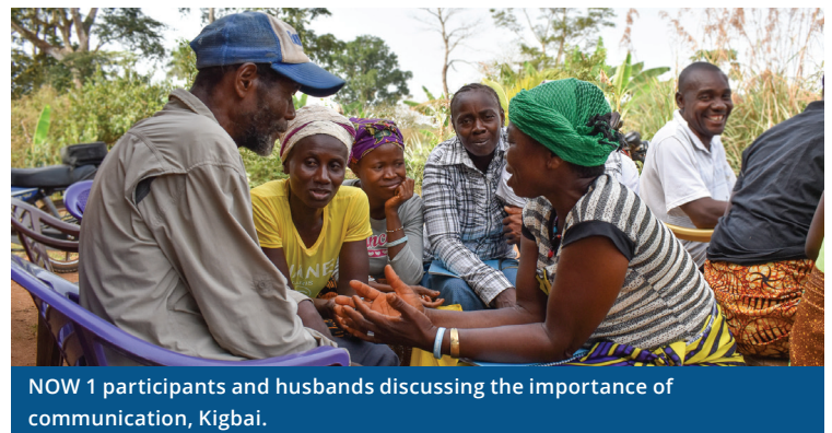
NOW 1 participants and husbands discussing the importance of communication, Kigbai.

Expand our Board of Directors to include Sierra Leoneans and individuals outside of the Minneapolis-St. Paul region and hire Sierra Leonean leadership to lead operations and strategy.